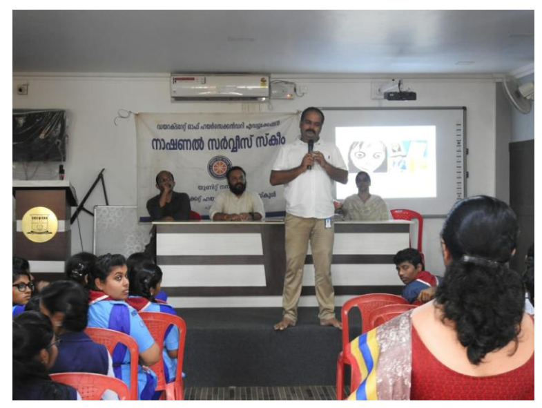
Cyber Law and Security Awareness Programme at Catholicate Higher Secondary School, Pathanamthitta