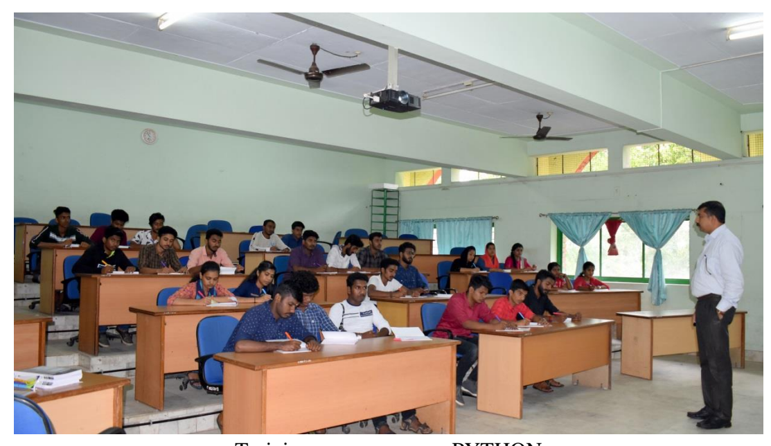
Training programme on PYTHON

The College organizes outreach programmes in other colleges for providing capacity-building training and creating awareness about career opportunities for the students.