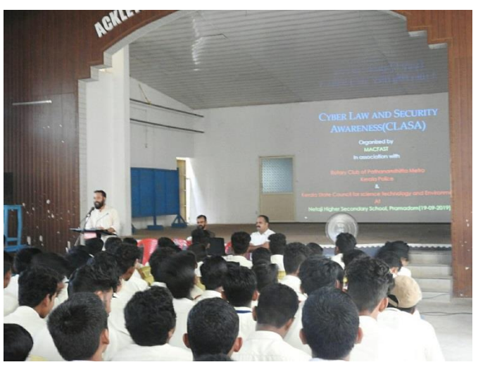
Cyber Law and Security Awareness Programme at Netaji Higher Secondary School, Pramadom