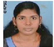
ASHA L. P. 11.07.2014

(Funded by the Ministry of HRD, Govt. of India)