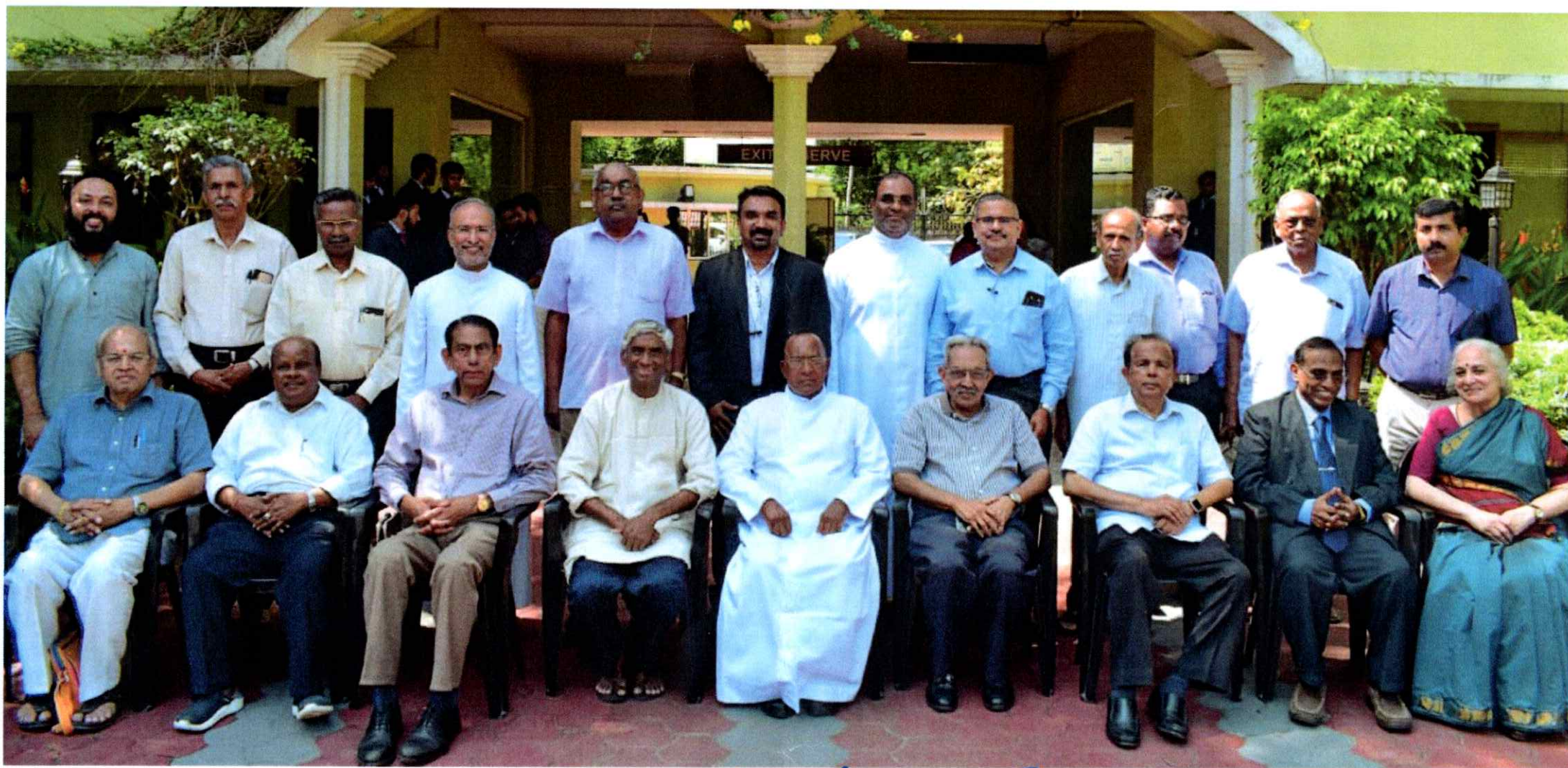
Governing Board AND Academic Council