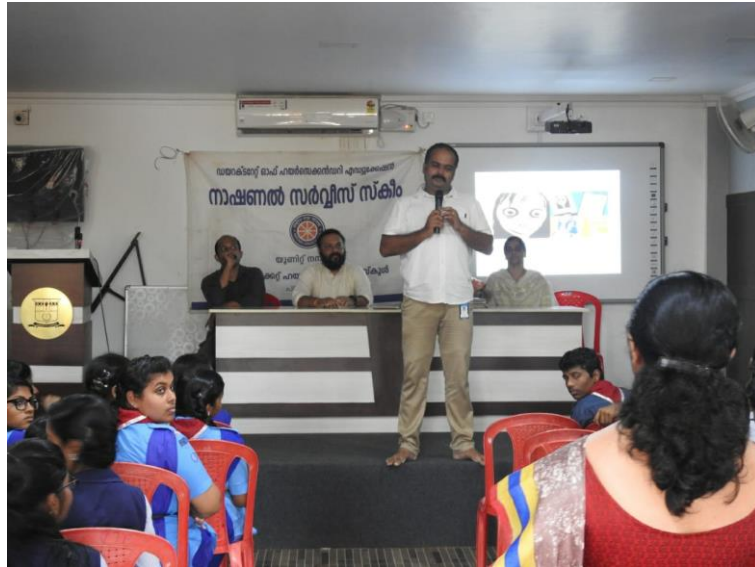
Cyber Law and Security Awareness Programme at Catholicate Higher Secondary School, Pathanamthitta