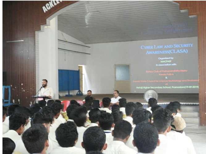
Cyber Law and Security Awareness Programme at Netaji Higher Secondary School, Pramadam