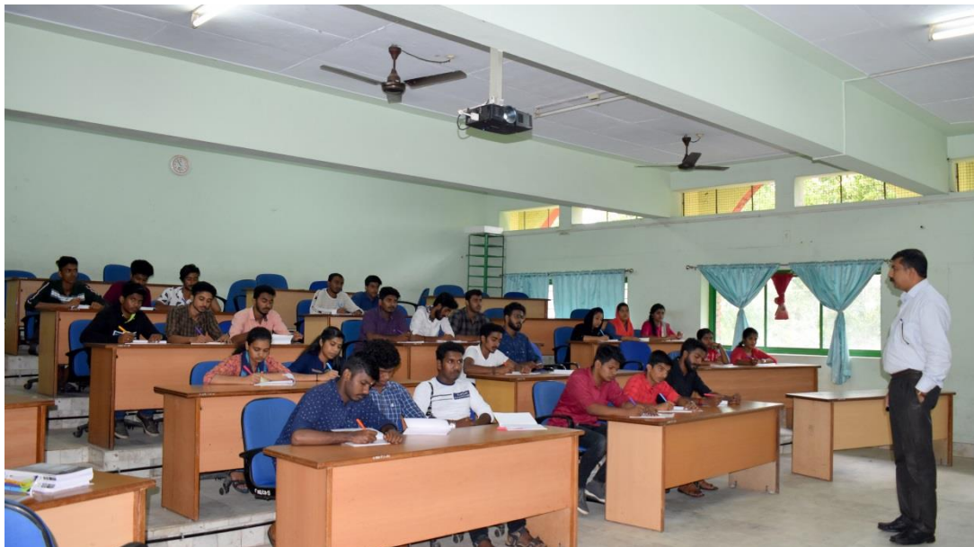
Training programme on PYTHON

The College organizes outreach programmes in other colleges for providing capacity-building training and creating awareness about career opportunities for the students.