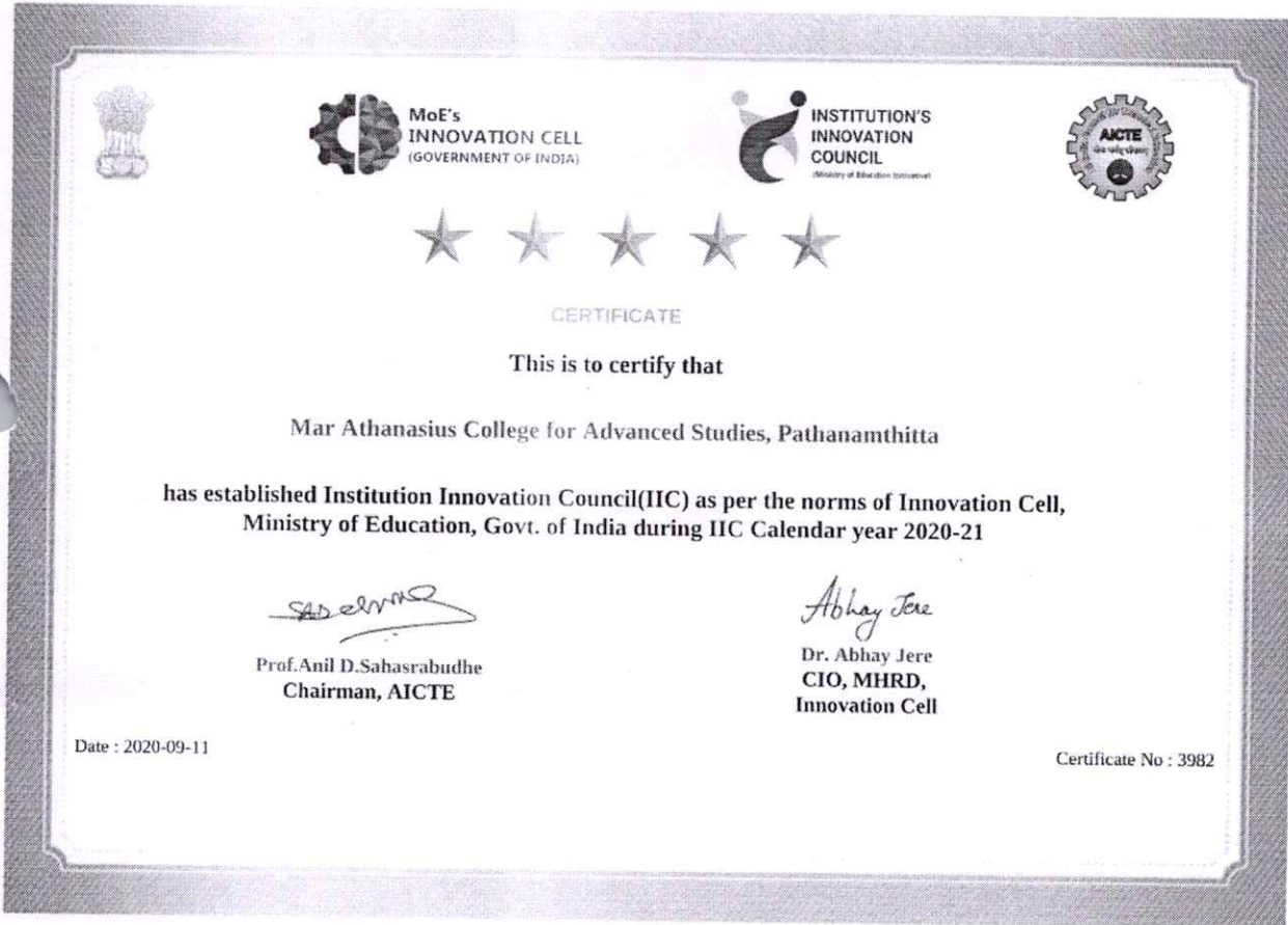
Figure: Certificate Issued by The Ministry of Human Resource Development, Govt of India