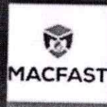
Phoenix Squad (...)