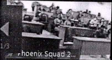
Phoenix Squad 2...