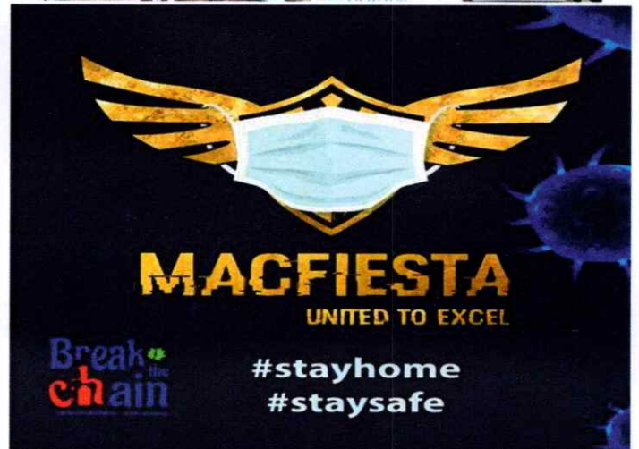
Awareness campaigns through social media