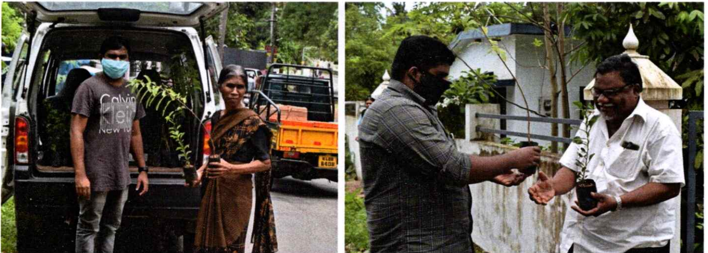
College staff distributing medicinal plants

The college distributed hundreds of Citrus, Pomegranates and Gooseberry plants to different households in Thirumoolapuram and among the public (auto rickshaw drivers) in Tiruvalla to promote cultivation of medicinal plants to combat Covid-19. Citrus, Pomegranates and Gooseberry fruits have been widely recommended for boosting immunity as they are rich in vitamin C.