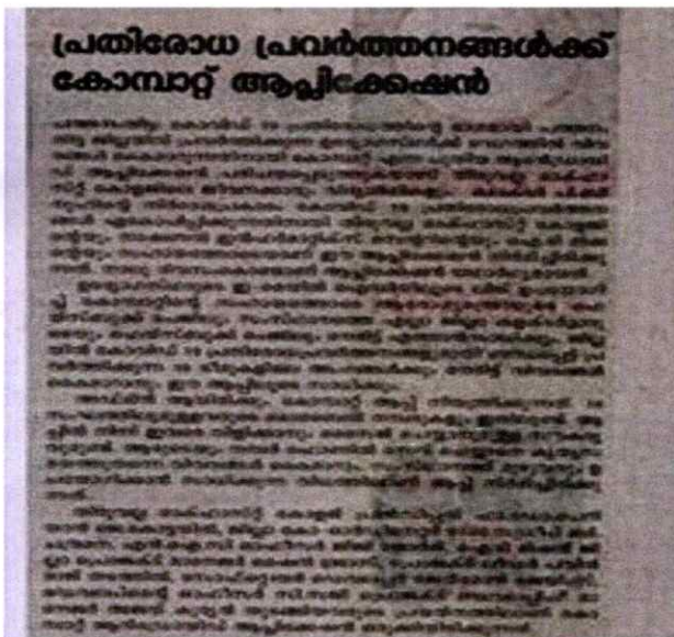
Deepika dated 17/3/2020