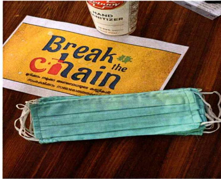
Masks manufactured in the college