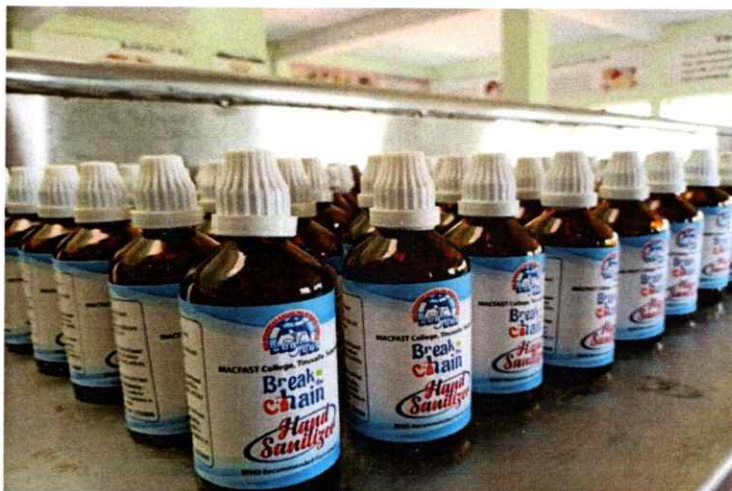
Hand sanitizers produced by the college

MACFAST has always tried to become the trendsetters not only in education but also in other non-academic matters of societal importance. Initiated by the School of Biosciences, we have produced more than 100 pet bottles of Hand sanitizers, produced as per the guidelines of WHO handrub formulations. 2000 Masks were also produced by the college as a preventive measure against the COVID-19 disease transmission. These measures have immensely helped the local governance in tackling the problem of providing sufficient materials required for mitigating the spread of the deadly virus.