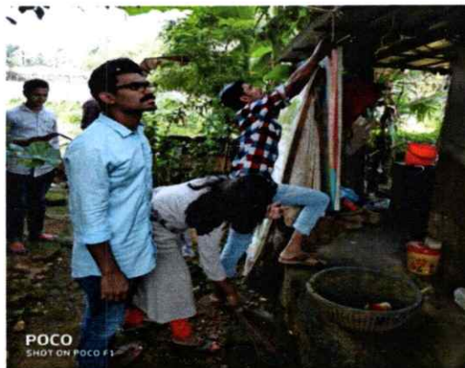
NSS volunteers cleaning the front of a flood affected house.