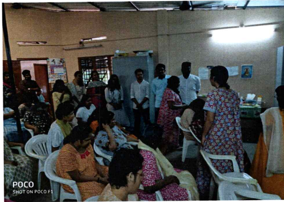
NSS volunteers interacting with the inmates of the relief camp.