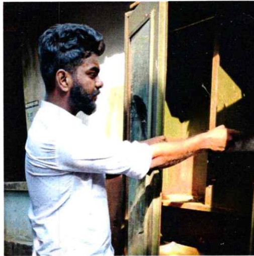
NSS volunteers cleaning the cupboard of a flood affected house.