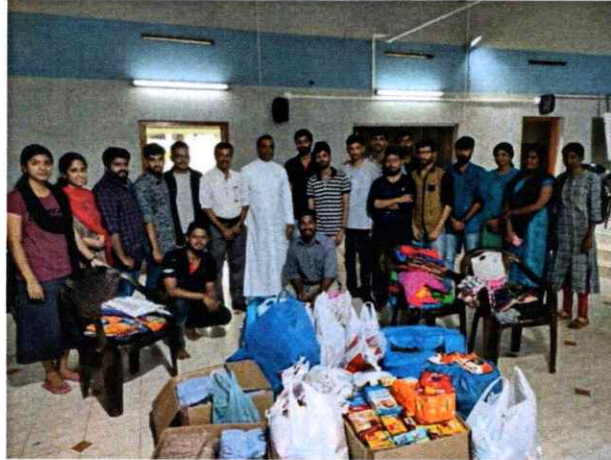
NSS volunteers posing for photograph in front of the items collected for distribution.