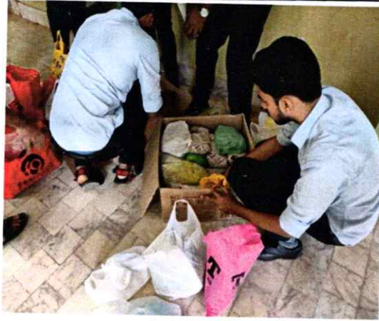
NSS volunteers arranging the lunch boxes for the noon meal programme.