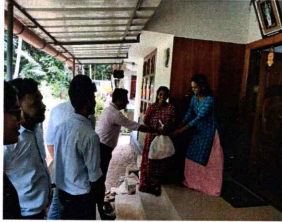
NSS volunteers distribute provisions to the families of the adopted village.