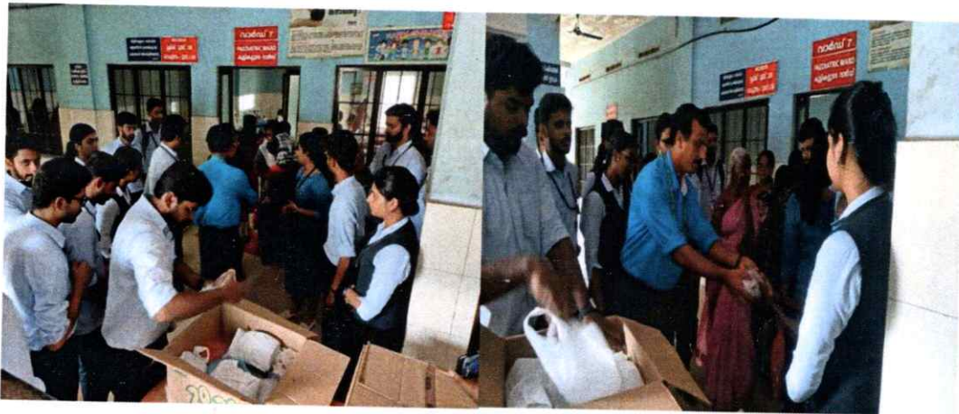
NSS volunteers distributing noon meal for patients at Thiruvalla Taluk hospital.