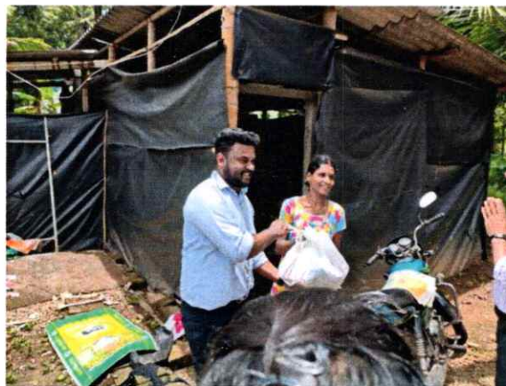
NSS volunteers distribute provisions to the needy people.