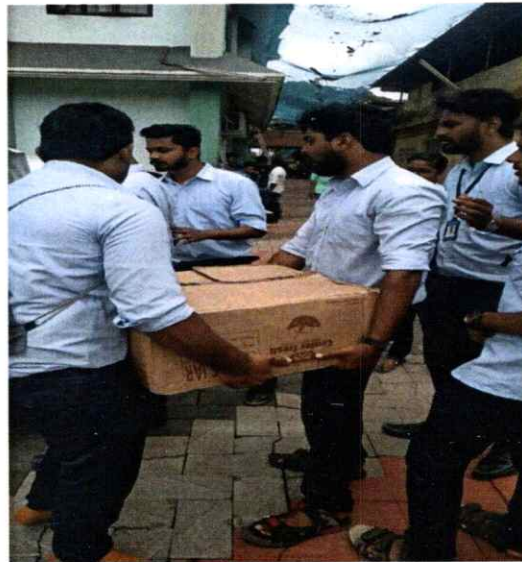
NSS volunteers carrying the aid kits for distribution to the DIET centre.