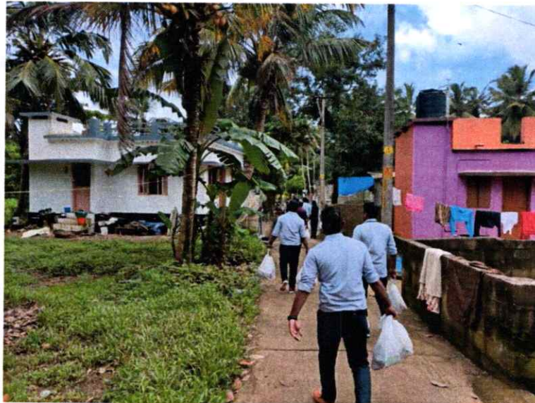
NSS volunteers carrying the kits for distribution to the people of the adopted village.