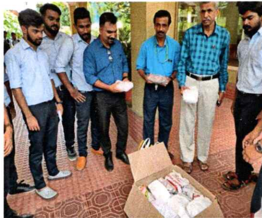
NSS volunteers with the lunch boxes for distribution before moving to the hospital.