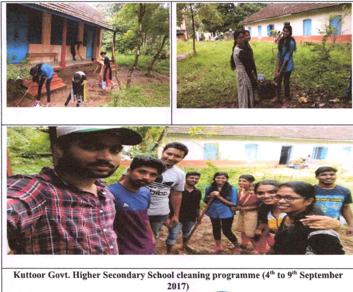
Kuttoor Govt. Higher Secondary School cleaning programme (4 th to 9 th September 2017)