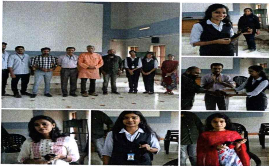
A collection of photographs showing MACFAST volunteers after donating their hair.