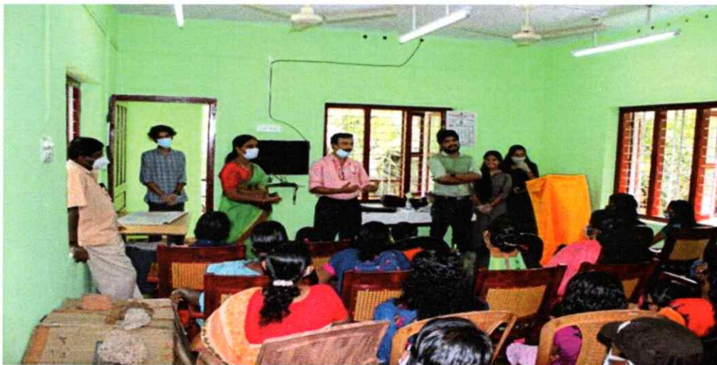
NSS volunteers leading the session on fast food hazards in the adopted village

In today's world the consumption of fast food has increased drastically, leading to several health issues. So, awareness regarding the health implications of fast food is the key for controlling its ill effects. So on 21 st July 2021, the NSS MACFAST unit, with the help of 5 volunteers conducted an awareness programme in the adopted village in the presence of local ward councilor Ms. Sheena. NSS volunteers Gayathri, Vishnu and Poornima took an effective class and many local people actively participated in this awareness program. They were eager to listen to the class as it was a new experience to them. We believe this effort of sharing our knowledge and experience can make a positive impact in the society.