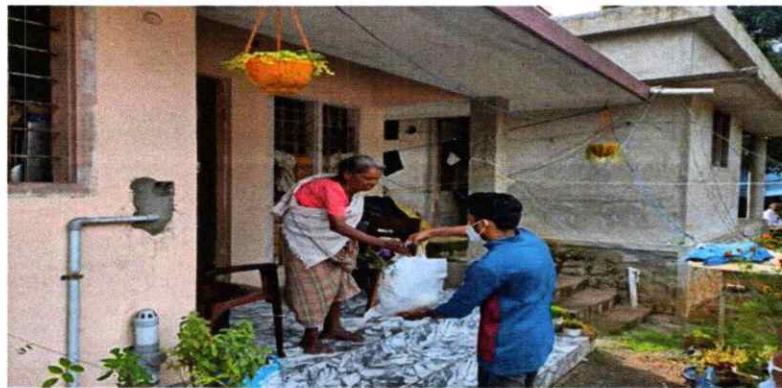
NSS volunteers distribute vegetable kits in the adopted village

Onam is a festival of annual harvest in Kerala, and is celebrated by Malayalees wherever they live. It is a festival of harvest, abundance and prosperity. During Onam, everyone irrespective of rich or poor prepares the traditional meal called ' Onasadhya '. The NSS volunteers of MACFAST offered a helping hand to poor families during Onam by distributing Onam kits. The most deserving families from various villages and colonies are selected for distributing kits. The volunteers did the packaging and door delivery. The vegetable kits were distributed in the NSS adopted village. Each volunteer contributed Rs.50 for gathering the essential vegetables for preparing the Onam kit. We are proud of using handmade cloth bags by our volunteers instead of plastic bags for distributing kits. 31 NSS MACFAST volunteers visited the adopted village and gave the onam kit as a gift. Besides, we also distributed LED bulbs for saving energy for future generations. Local ward councillor guided in this endeavour. NSS MACFAST unit is very happy to be a part of social welfare activities.