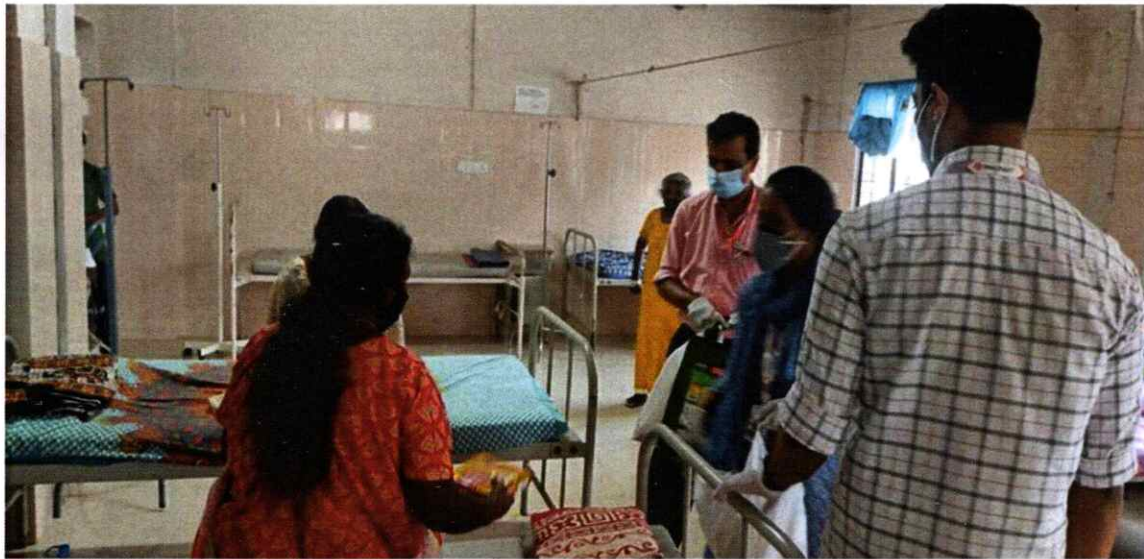
NSS volunteers distribute noon meal to patients at Taluk Hospital, Tiruvalla